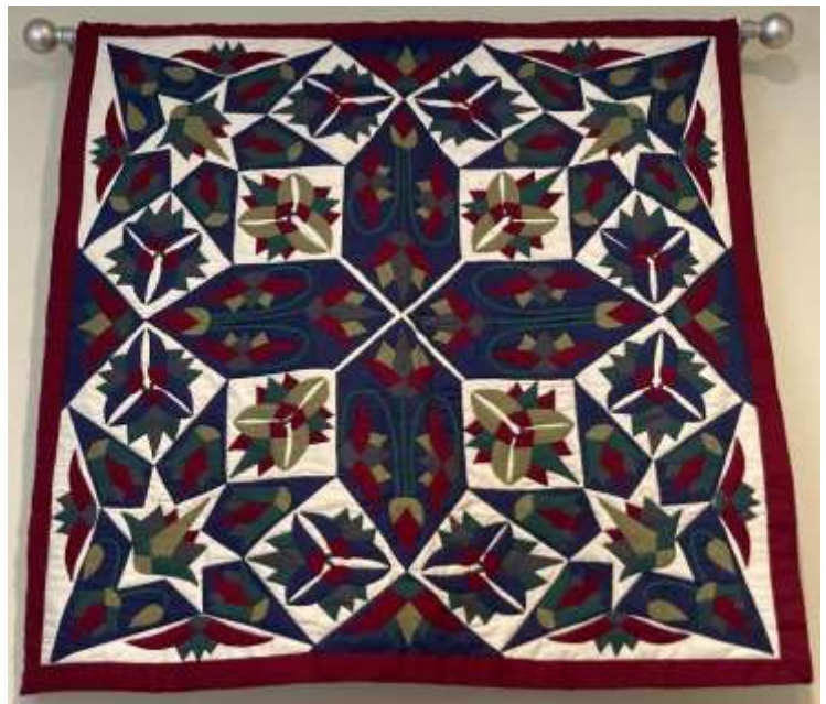
Modern tourist trade applique wall hanging.