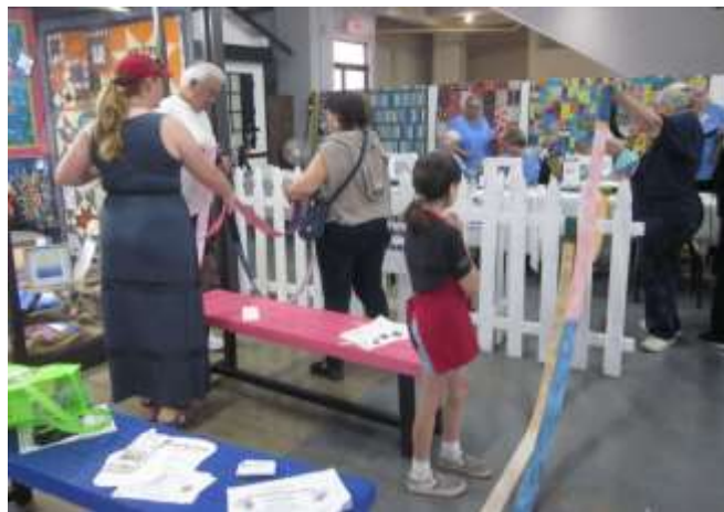
Lots of info passed out and hands on with fair folks