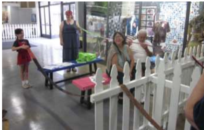
Fairgoers help out!