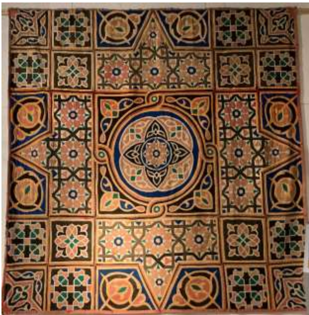
Museum piece from Ali Dynasty.

Applique is still practiced today for religious usage and the tourist trade. Most is handwork produced by male embroiderers. I found the shop I visited interesting and the proprietor compared the embroidery work and colors selections to Amish quilts. Most of his embroiderers were men, although women also work from home today.