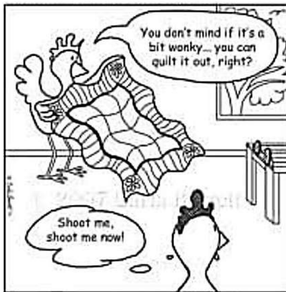
What Machine Quilters REALLY Think