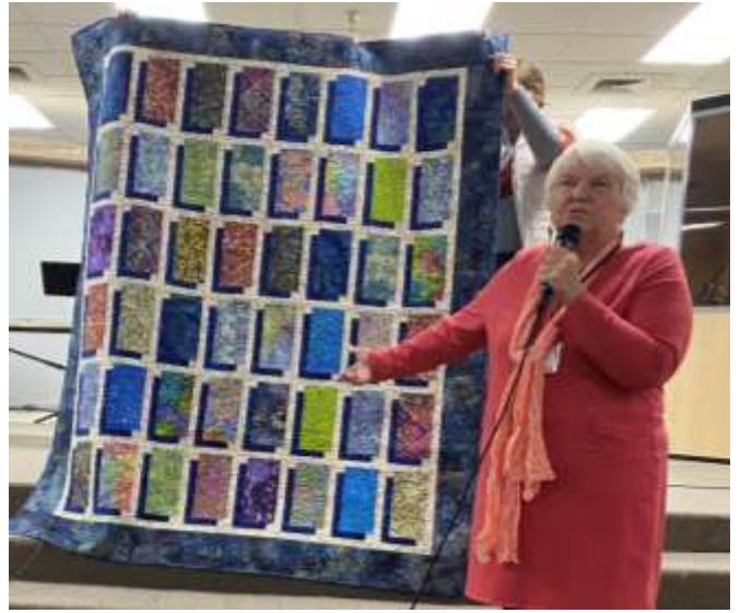
These two quilts are by Signe Kaleel. The one on the left is Pastel Crumbs from fabrics from the 30's, 40's, 50's and 60's. The one on the right is Shadowed Batiks. The batiks are off center with black shadows.