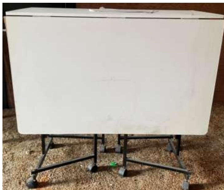
Folding Cutting Table