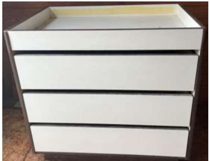
Set of Drawers