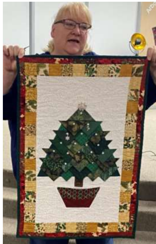
Kim's Advent wall hanging