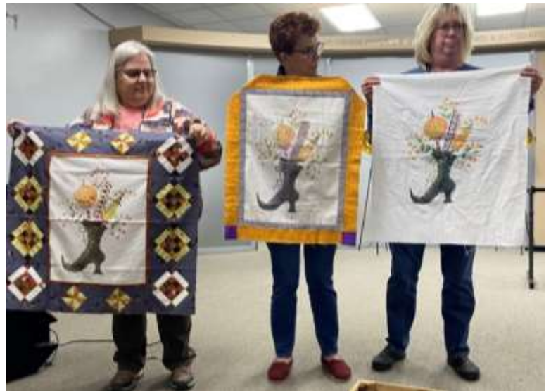
Witches Brew Workshop Quilts