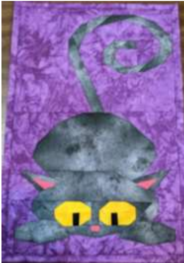
She liked it so much she made herself a placemat.