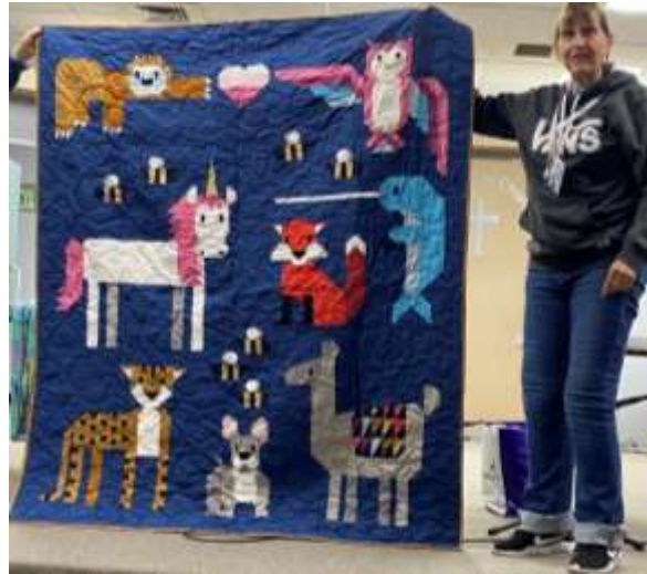
Trending by Teri Meggers BOM from Art East Quilting Animals