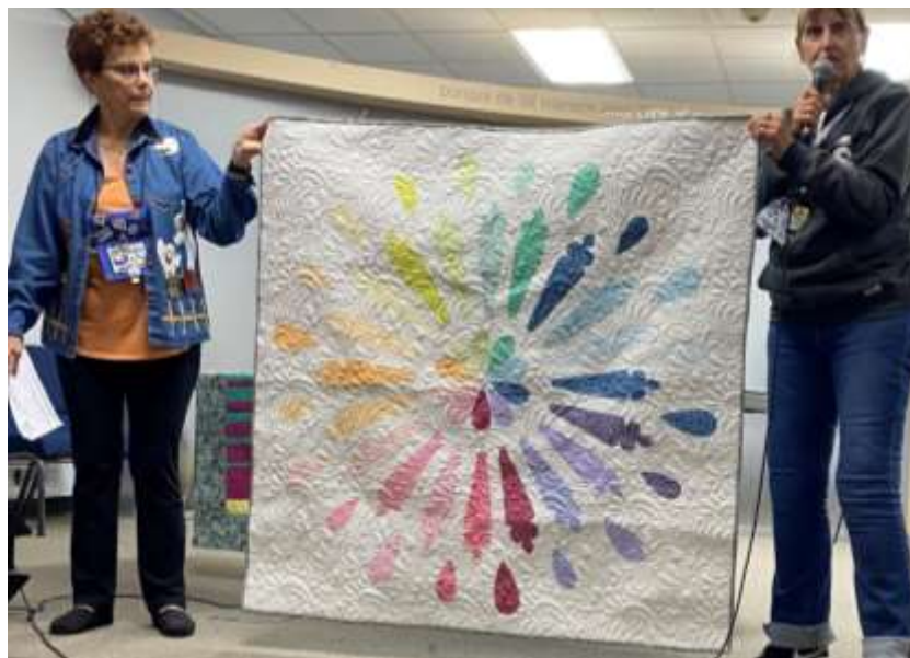
Cathedral by Teri Meggers. All three quilts were quilted by Sewing Escape.