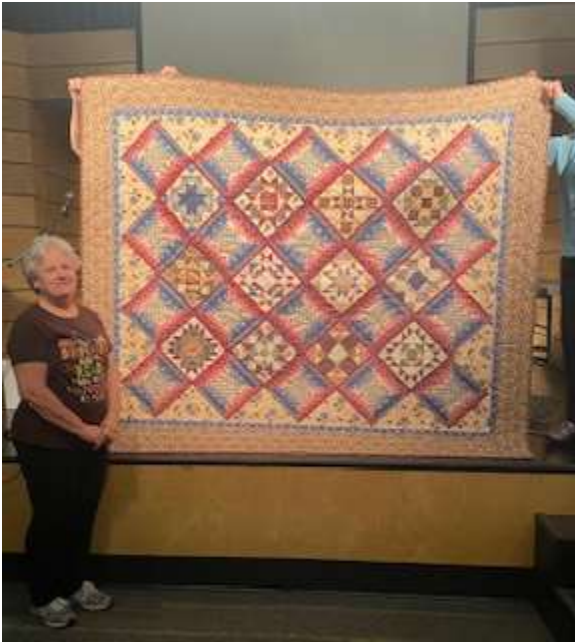
Peace and Unity by Lori Davies Quilted by Bears Quilt Shop UFO challenge #2. Kit purchased long ago.