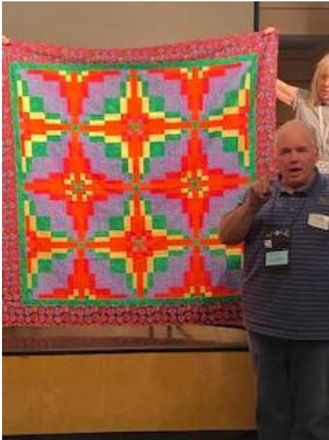
Fractured Rainbow rotated