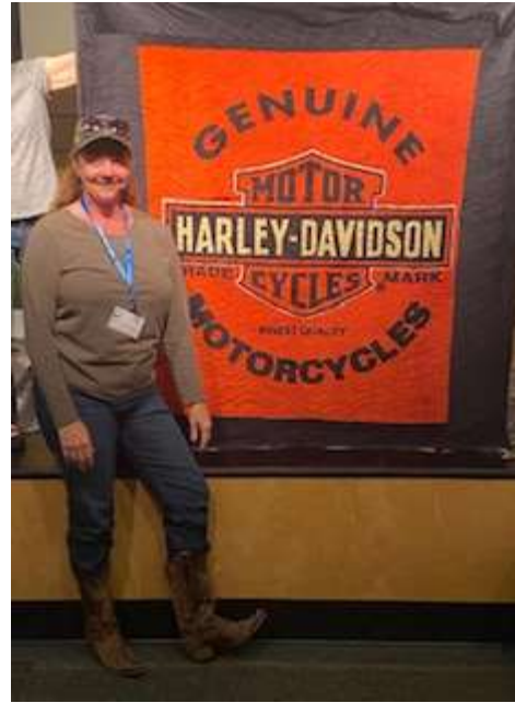
Front and back of the Harley Zoom Zoom quilt designed by KP Peysar and Mimi Murray. Quilted by KP.