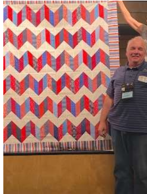
Patriotic Zig to be donated to the VA.