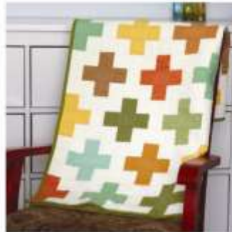
On the Plus Side