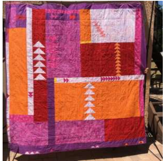
Back of Quilt