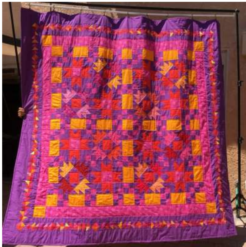
Front of Quilt