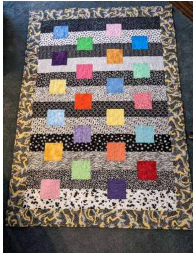
Scattered Squares for charity