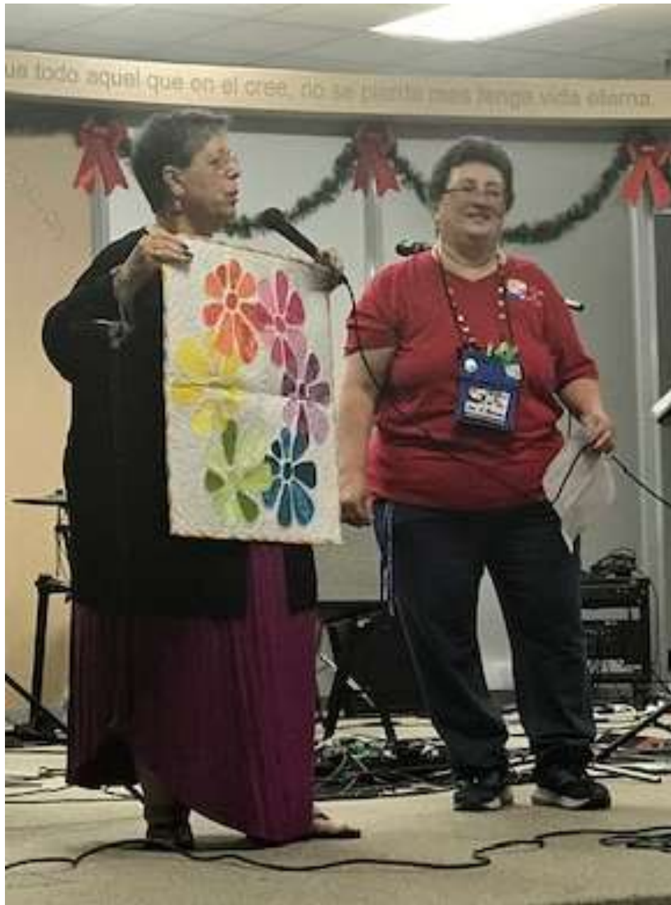
January Workshop Sample