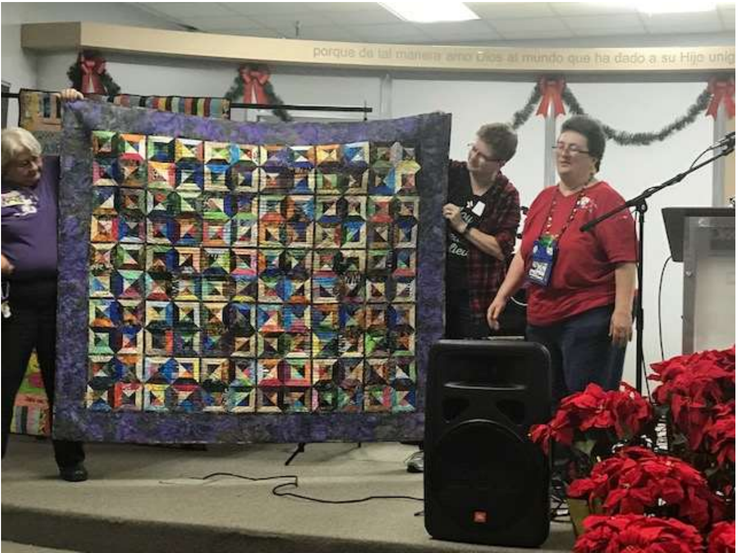
The Presentation of the President's Quilt