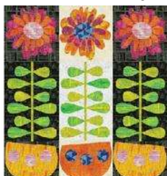
GARDEN PARTY Modern Flower Pots & Leaves Give You Lots to Texturize with Decorative Stitches

See workshop table or QBS website for supply list.