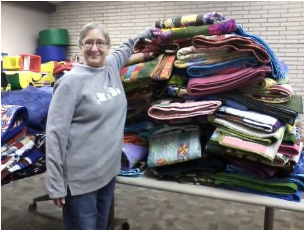
The sorting of the Charity Quilts at the Icaboni Library