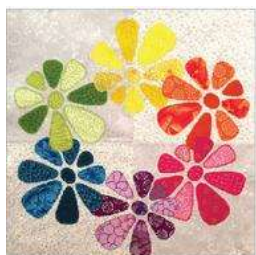
SPLENDOR Simple Pop Art Flowers Make This Appliqué Super Easy & Fun