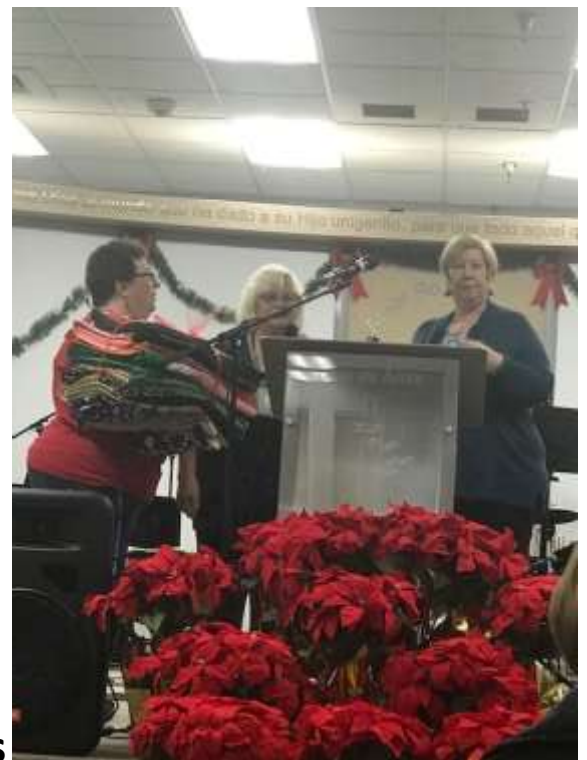
The Distribution of the Charity Quilts